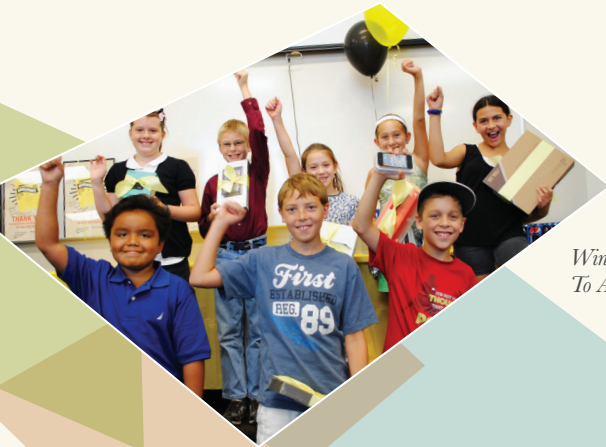
Winners of the 2012 "Passport To Adventure" Program